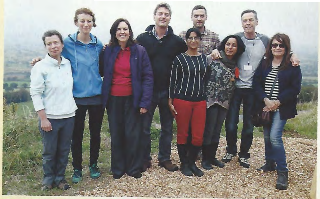
The artists and representatives of the partner organisations in the project.

Visitors have been flocking to view the 'LANDMARKS', four striking temporary artworks sited at locations around the Forest of Bowland. Due to the huge public interest, the sculptures are staying in place until the New Year.